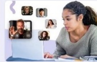
Live Group Classes