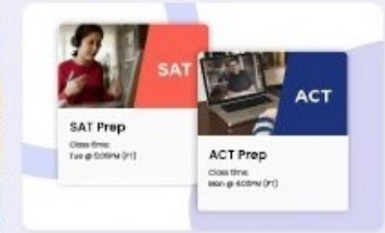
SAT & ACT Test Prep Classes