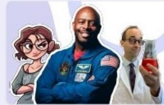
Celebrity-Led StarCourse Classes