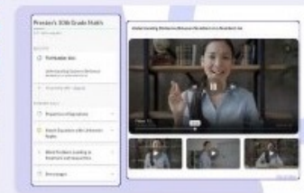
Self-Study & Practice Problems