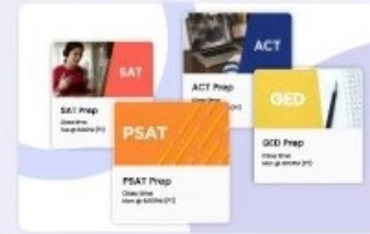
College & Career Readiness