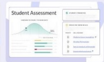
Practice Tests & Personalized Learning Plans