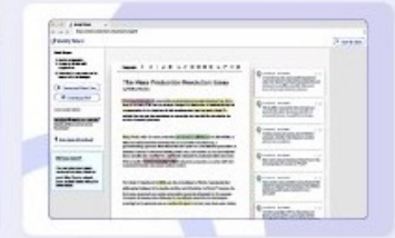
On-Demand Essay Review